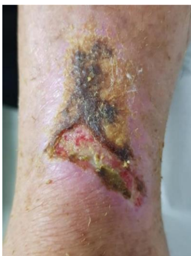
Fig. 8 – 1 st day of service