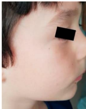
Fig. 7 – 1 year later