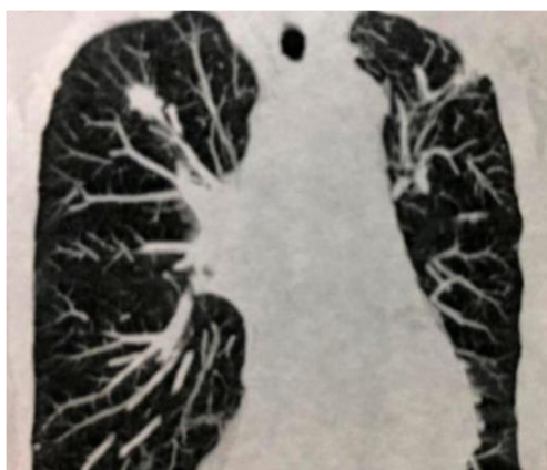
Fig. 1 – 1 st meeting – Front CT without contrast

Such medicine that will exist, being concerned with the well-being of the mind and with less medication, is presented in this clinical chart. We only saw similar facts at the time of Jesus of Nazareth who, without any means, he healed 15 . We think that, in the future, we can say: If we are good, we can be better. This will be true for any sector of medicine. How to explain a closed wound without stitches and a hospital? 16