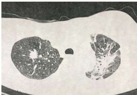
Fig. 3 - 1 st meeting – Sagittal Tomography without contrast