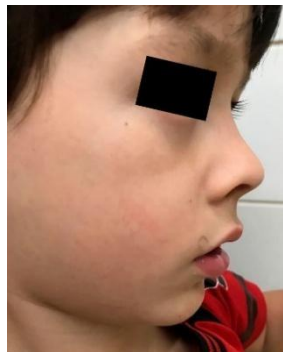
Fig. 6 – 1 month later