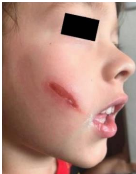
Fig. 5 – accident day