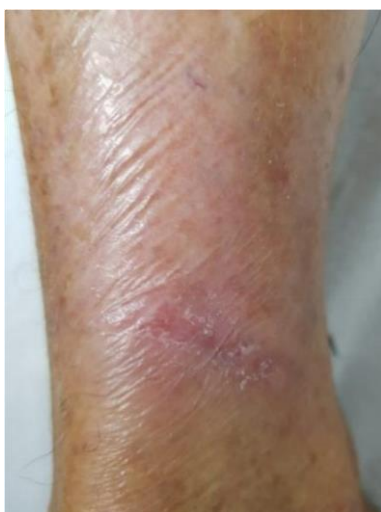
Fig. 9 – 28 th day of service